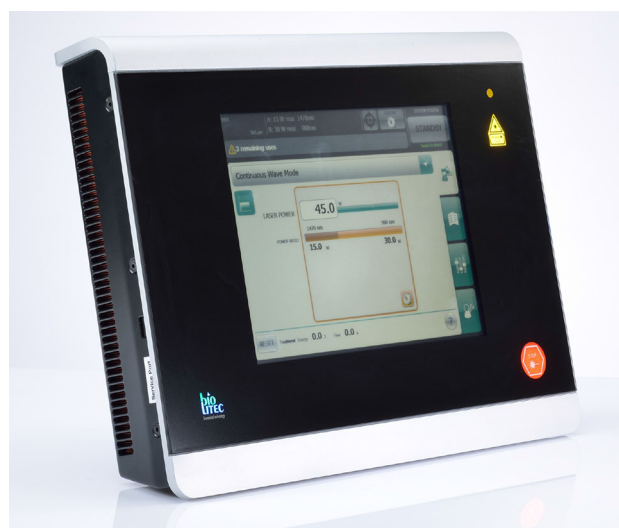
Fig. 1 Leonardo DUAL 45 ® diode laser from Biolitec AG, Germany. Wavelength 980–1470 nm. Maximum energy 15 Watts

The laser probe was inserted through the perineal fistula opening using either a “Ceralas ® ” (or more recently, a “Leonardo DUAL 45 ® ”) diode laser (Biolitec AG, Germany). This type of laser delivers energy at a wavelength of 1470 nm (Fig. 1) providing an optimal absorption curve in water which is considered to result in a more efficient local tissue shrinkage and protein denaturation. When there is no longer any water in the tissue and the temperature exceeds 100 °C, a white smoke vaporization effect is observed. The use of this wavelength by the radial-tip laser fibre permits destruction of the granulation and epithelial tissue causing a 2- to 3-mm zone of controlled tissue damage with less power (13 W) and a diminished likelihood of perifistular collateral